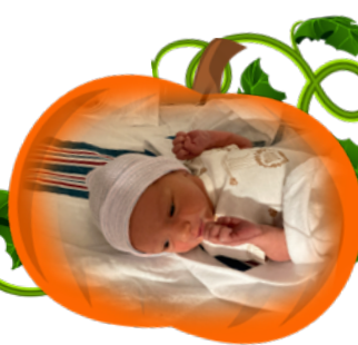
Rowan Levi placed August 23, 2024