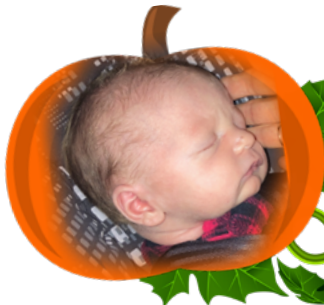
Carter Lewis placed July 30, 2024