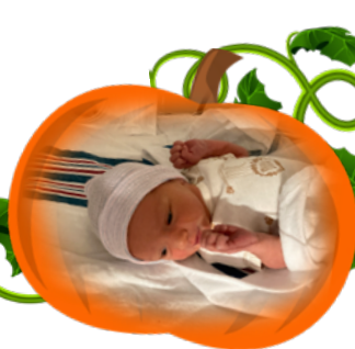
Rowan Levi placed August 23, 2024