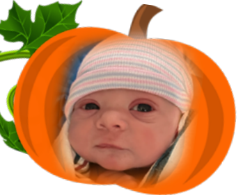
Chandler Atlas placed September 10, 2024